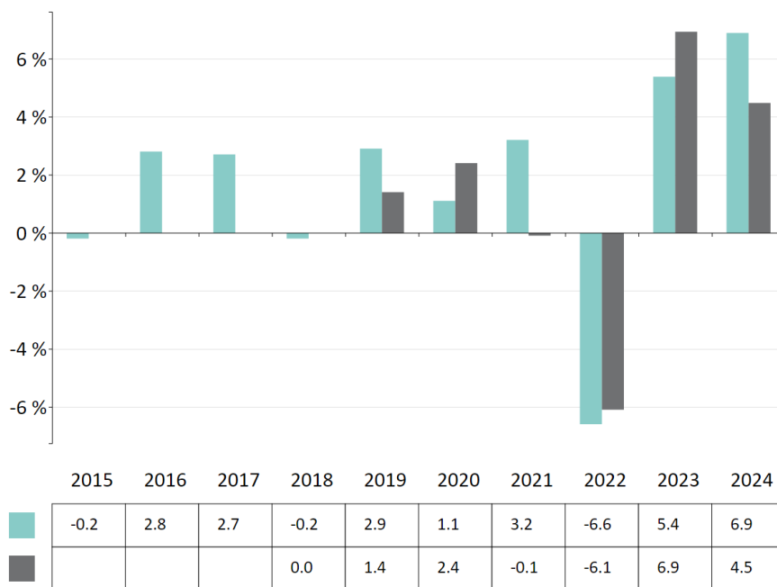
■ Öhman Företagsobligationsfond C ■ Solactive SEK NCR Fix Short IG Corporate Index * NOMX Credit Total Return, t.o.m 2020-05-31

The fund was launched 2003. The share class C was launched in 2017. The graph shows the performance of the fund before this share class started. The past performance figures are calculated in SEK (Swedish krona), and on the basis that any distributable income of the fund has been reinvested.